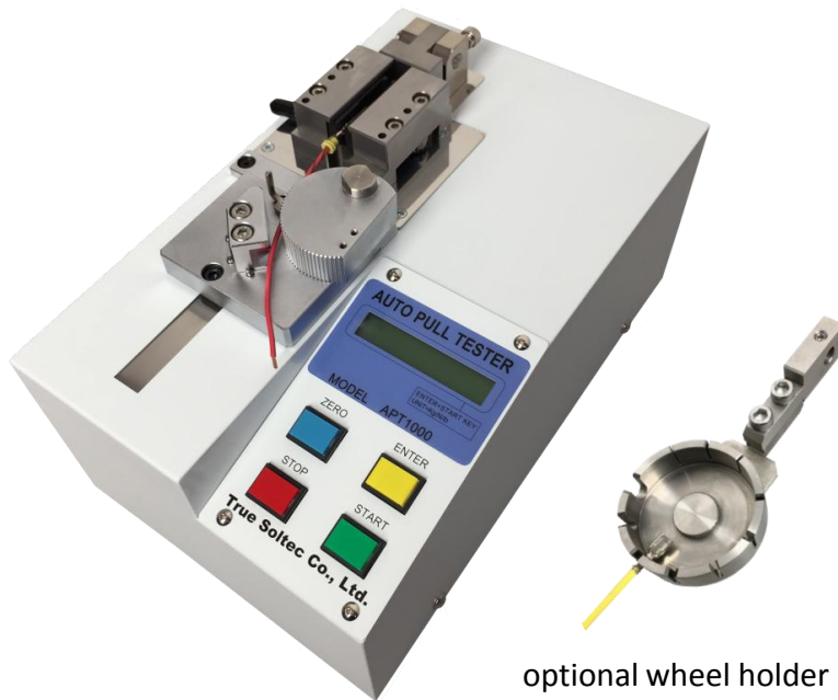
optional wheel holder